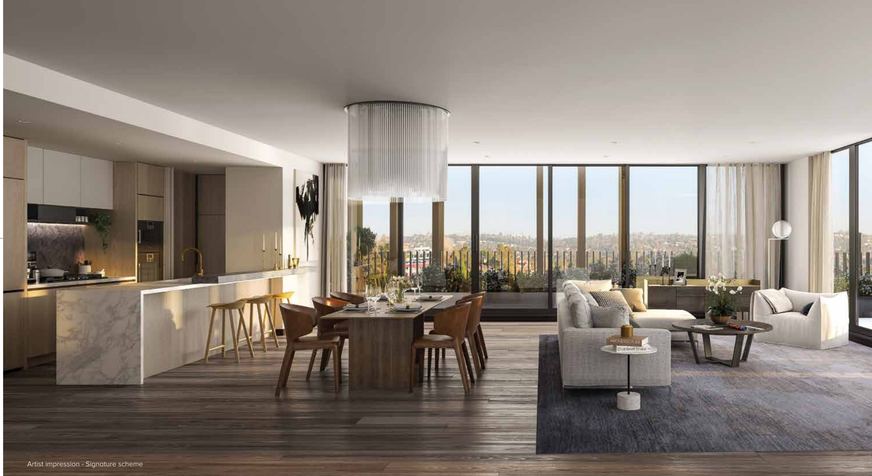
Artist impression - Signature scheme

luxurious bronze fixtures and finishes throughout and encased in an abundance of natural light.