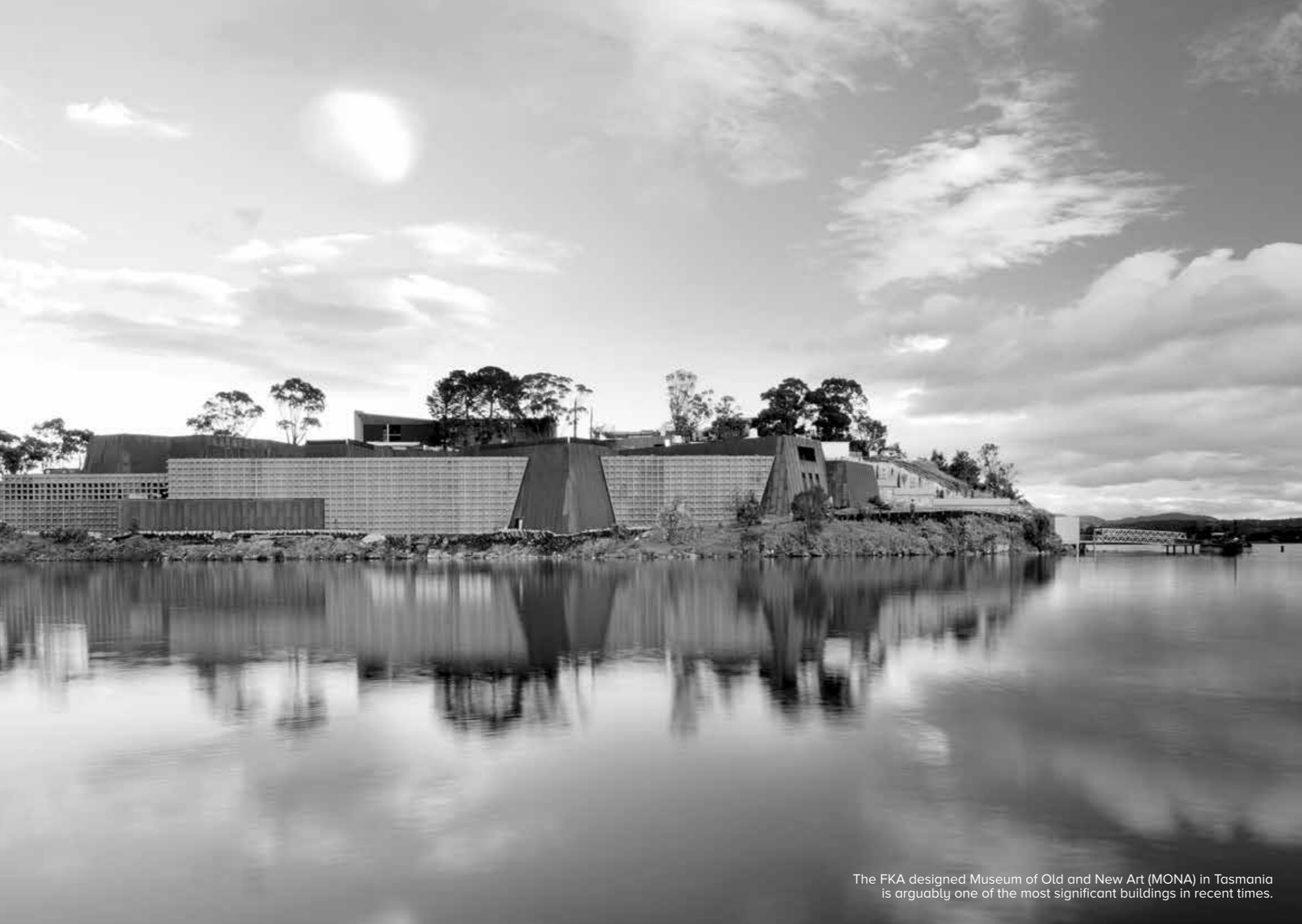
The FKA designed Museum of Old and New Art (MONA) in Tasmania is arguably one of the most significant buildings in recent times.