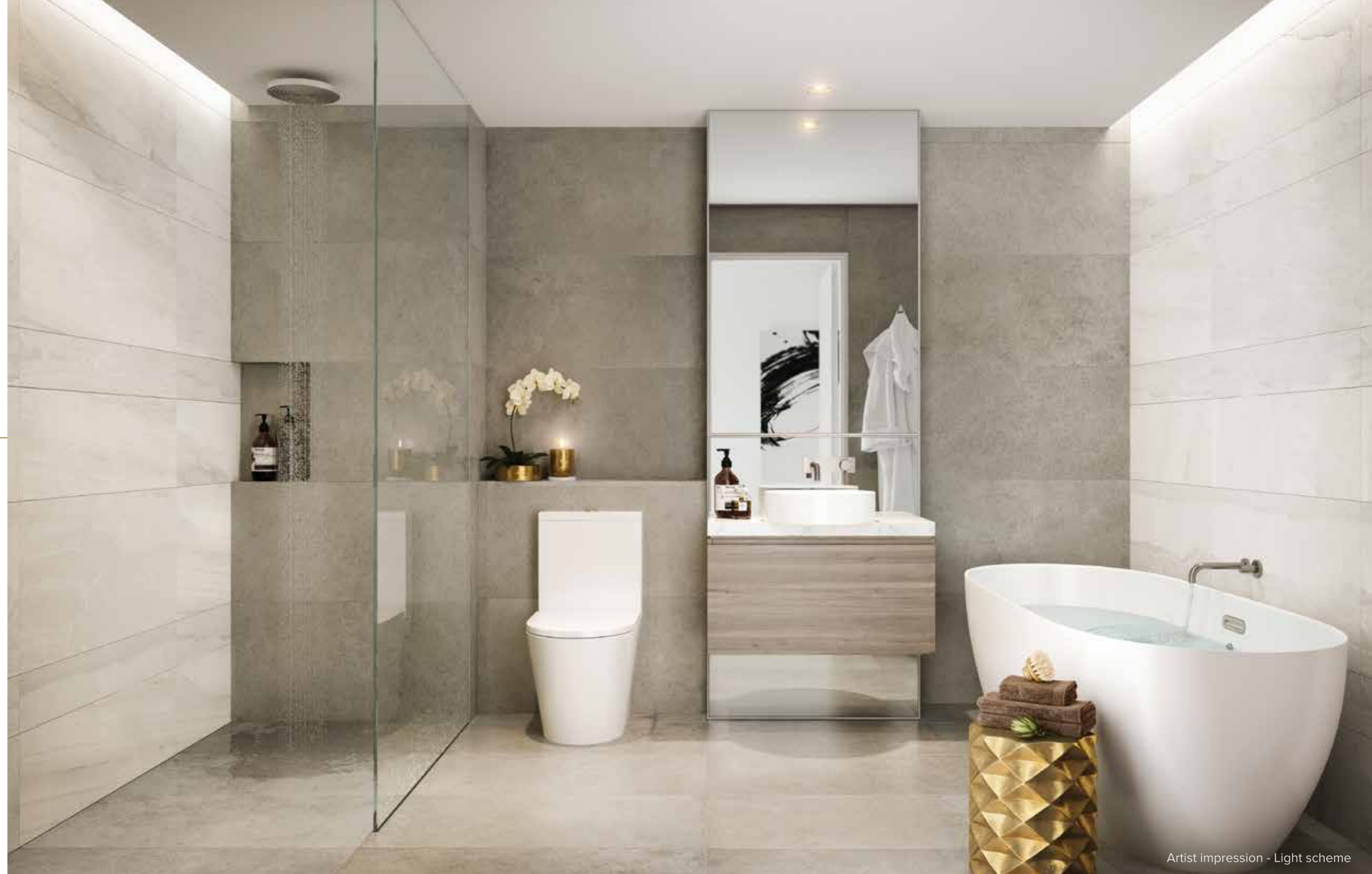
Artist impression - Light scheme

Accentuated by an elegant freestanding tub, instantly drawing focus. The textural elements add a layer of depth to the room with large feature tiles flowing from floor to ceiling, complemented by a floating vanity and quality joinery.