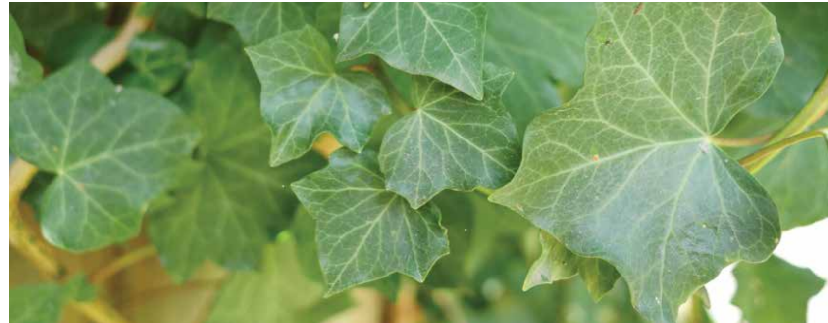
Clockwise from top left, The historic town hall. Local architecture. Upper Heidelberg Road bakeries. Cafes at your doorstep in every direction. Lush greenery surrounds Ivanhoe.