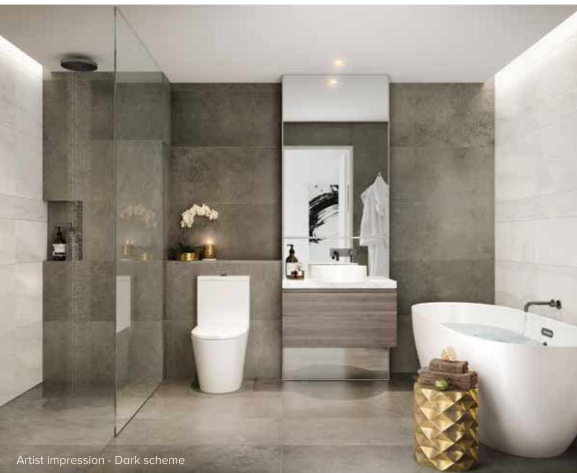
Artist impression - Dark scheme